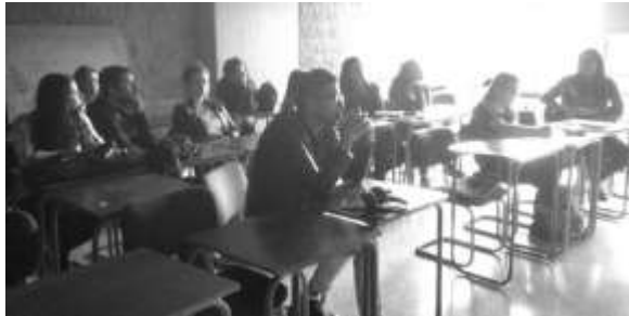
Bogotá, Colombia – November 2017