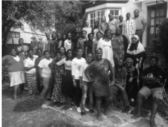
Johannesburg, South Africa – January 2018