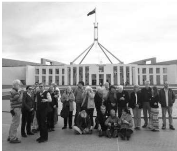
Canberra, Australia - 2017